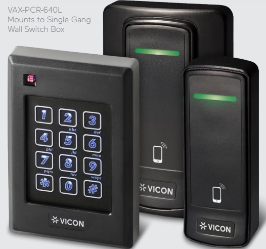
VAX-PCR-640L Mounts to Single Gang Wall Switch Box